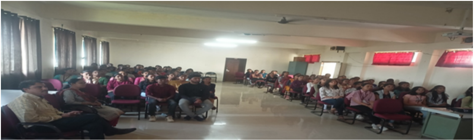
Self Defence Training For Girls Student